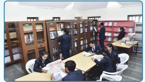
Well Equipped Library