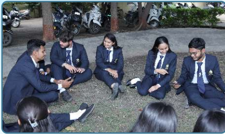
Wi-Fi Enabled Campus