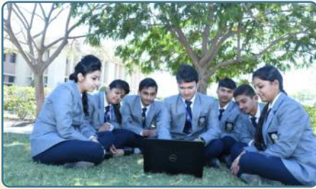
Wi-Fi Enabled Campus