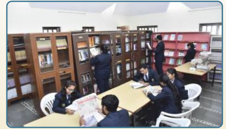
Well Equipped Library